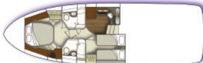
Lower Cabin Layout

(Shown w/Optional Salon Table and Aft Bench Seat)